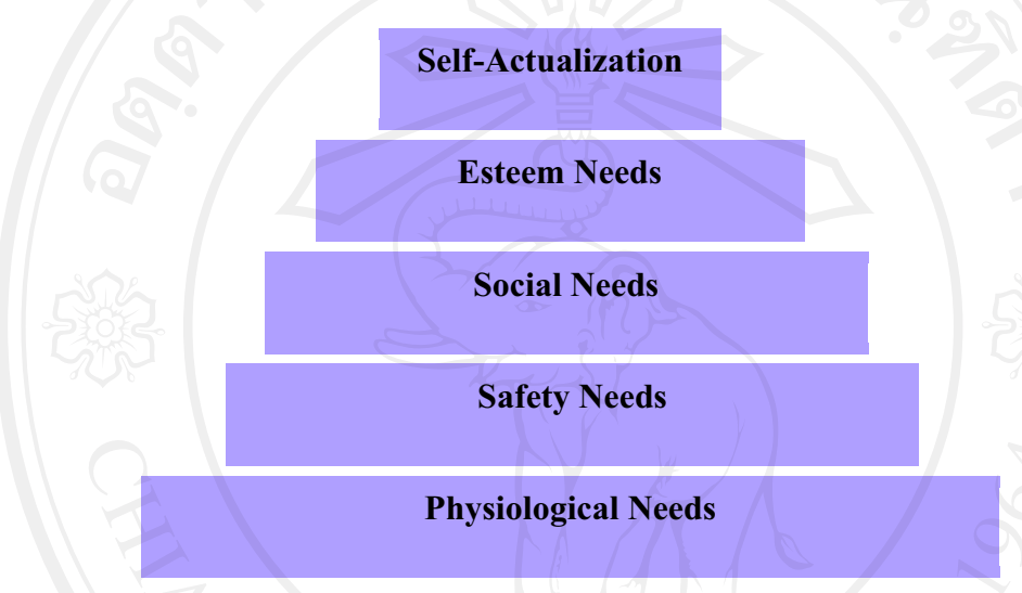
Figure 2.1 Maslow Need Pyramid

actualization. Satisfying needs is healthy, while preventing gratification makes us sick or act evilly. As shown in the following hierarchical diagram, sometimes called 'Maslow's Needs Pyramid' or 'Maslow's Needs Triangle', after a need is satisfied it stops acting as a motivator and the next need, one rank higher, becomes the motivator.