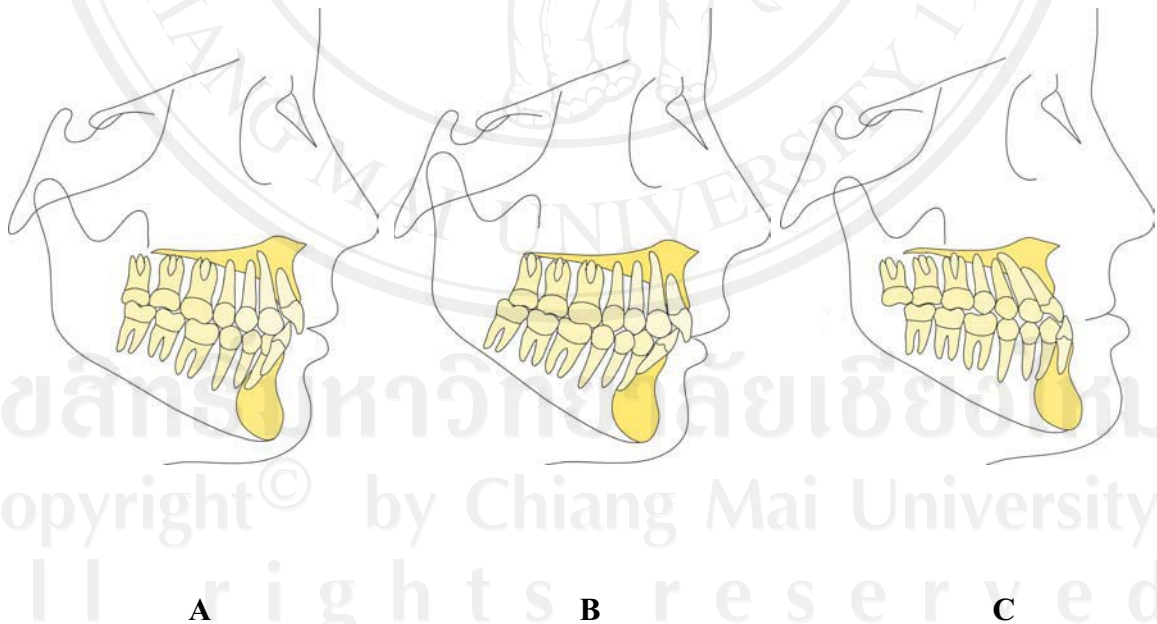
Figure 4.1 Schematics of characteristic dento-alveolar compensation in the patients with, A; skeletal Class I, B; skeletal Class II and C; skeletal Class III relationships

Characteristics of dento-alveolar compensation between different skeletal patterns were observed (Figure 4.1).